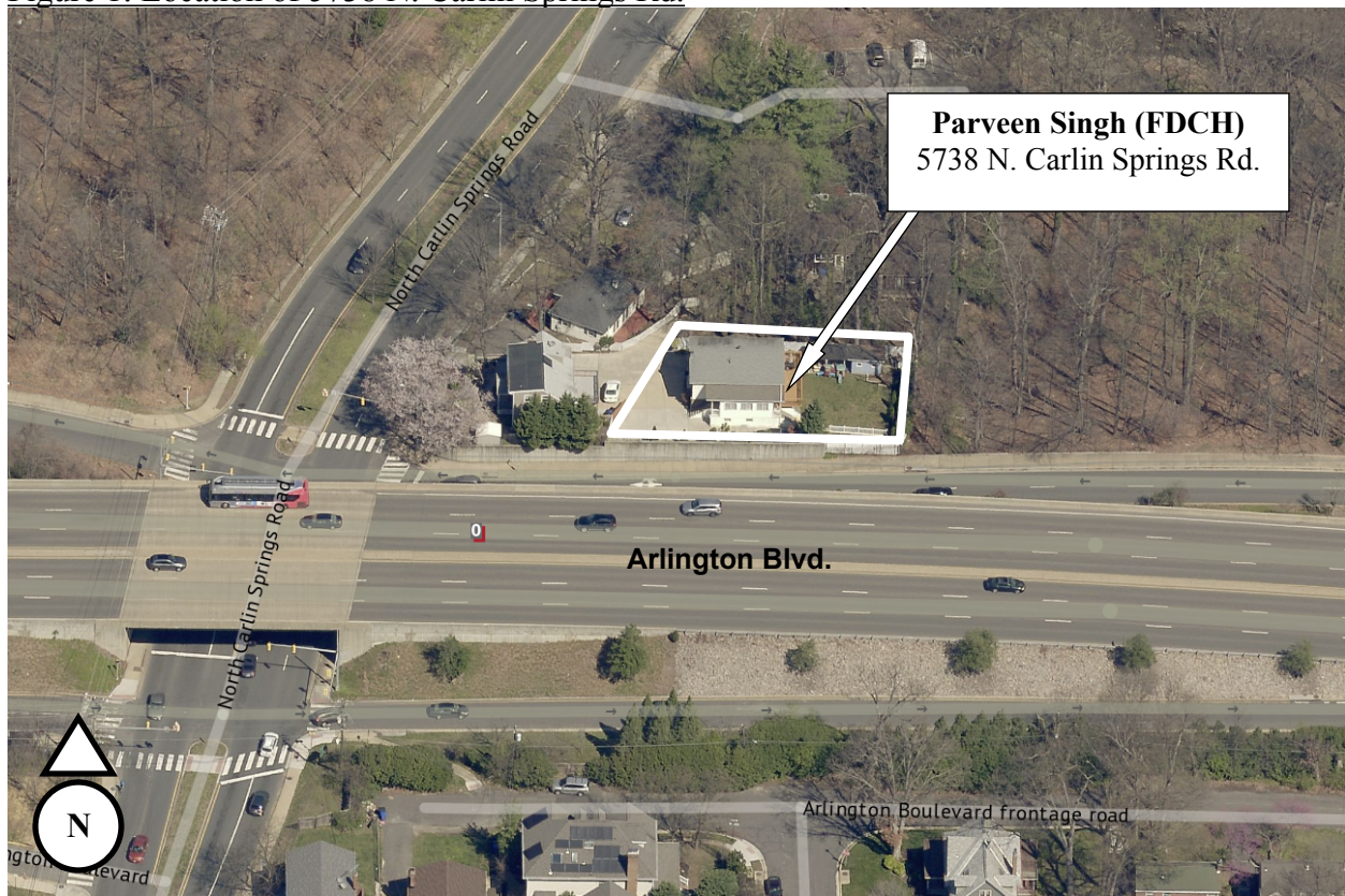
Figure 1: Location of 5738 N. Carlin Springs Rd.

DISCUSSION: This family day care home is approved to provide childcare from 6 a.m. to 6 p.m., Monday through Friday, and employs two (2) child care staff.