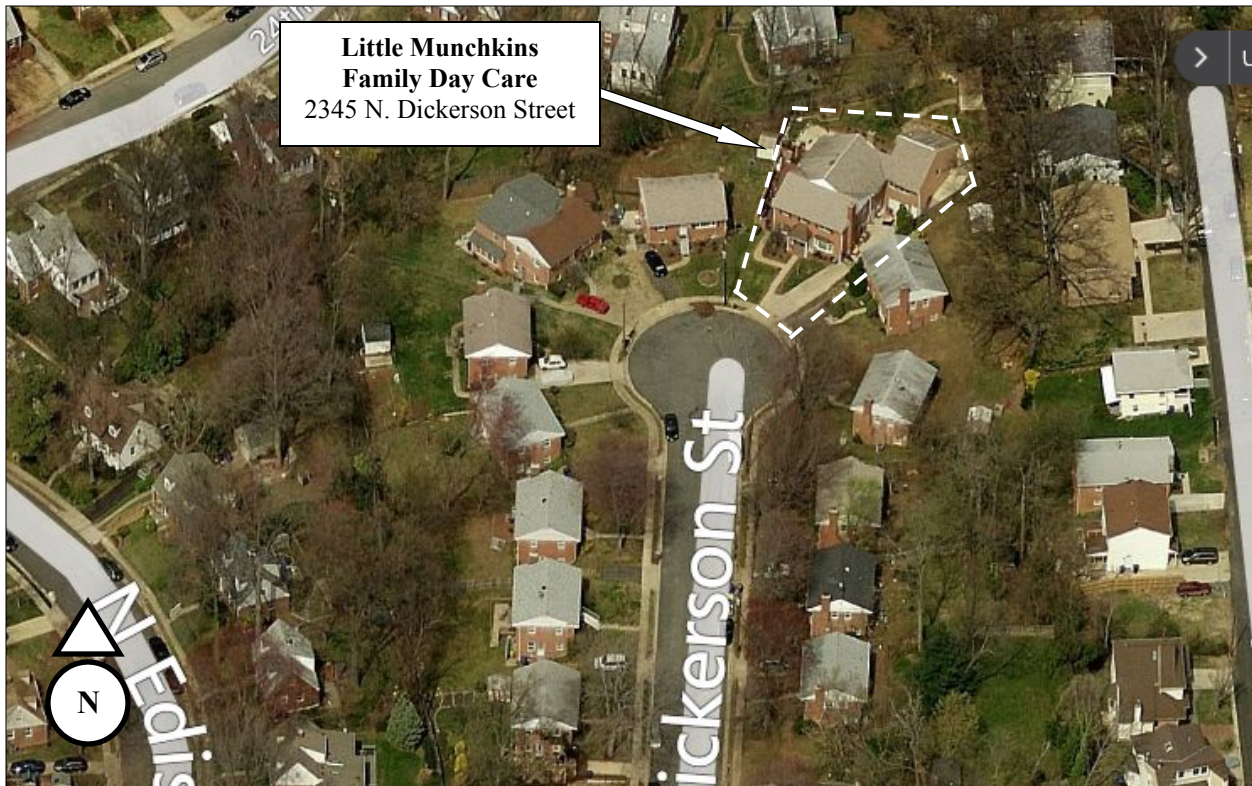
Figure 1: Location of Little Munchkins Family Day Care