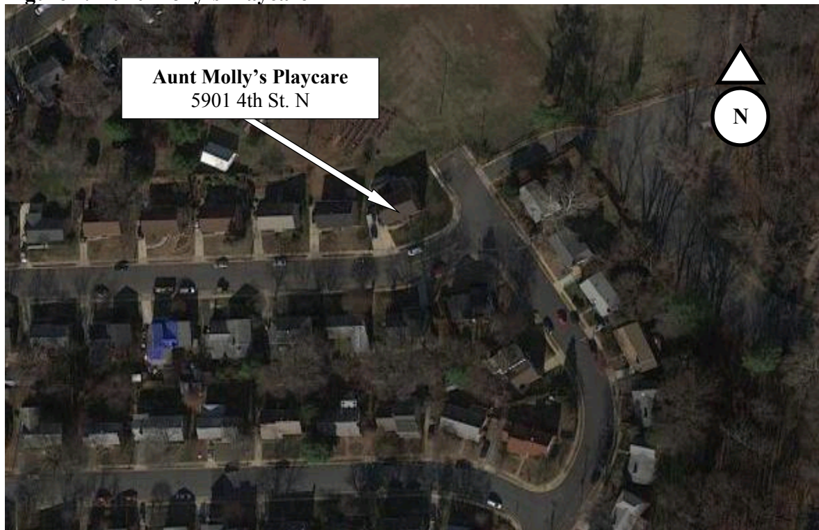
Figure 1. Aunt Molly’s Playcare

Street, to the south by 4 th Street North, and to the west by North Montague Street. The site is zoned “R-6” under the Arlington County Zoning Ordinance , and the site is designated on the General Land Use Plan as “Low” Residential (1-10 units/acre).