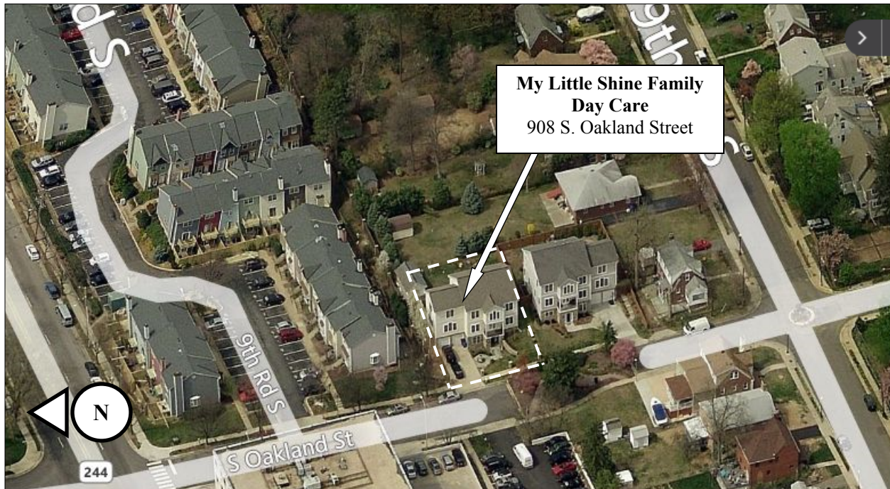
Figure 1: Location of My Little Shine Family Day Care