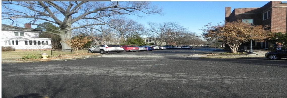
Figure 2. Parking lot and entrance