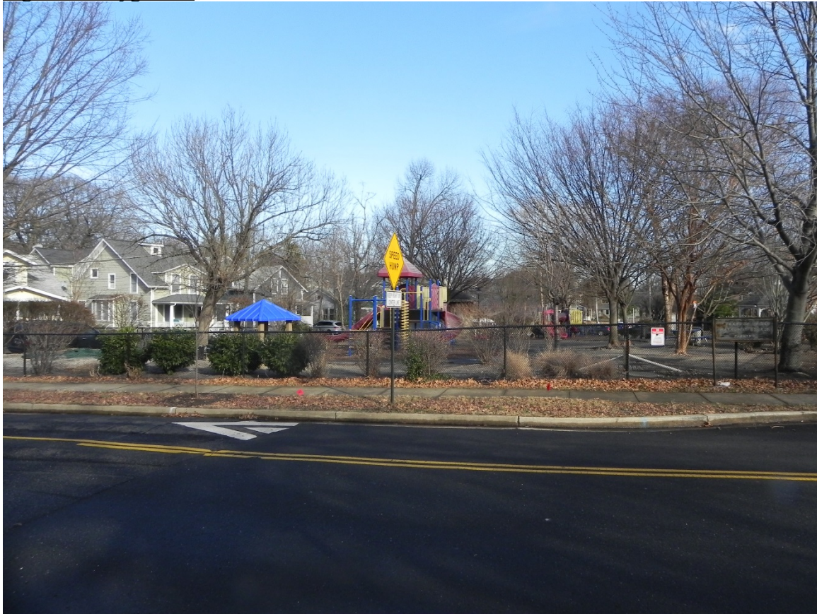
Figure 3. Playground