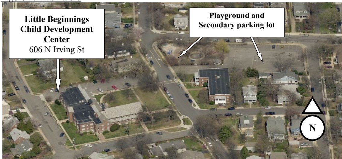
Figure 1. Ariel View

Existing Land Use: The primary land use on this property is a religious institution (Clarendon United Methodist Church). A use permit on this property allows for a child care center for up to 76 children.