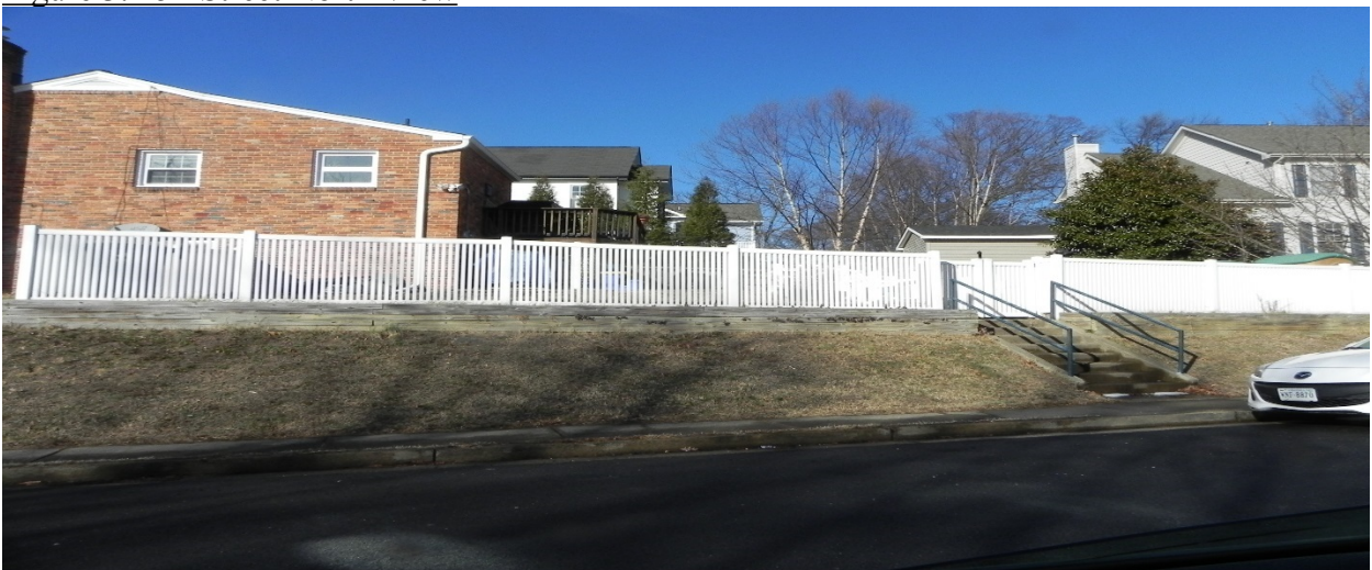
Figure 3. 15 th Street North View