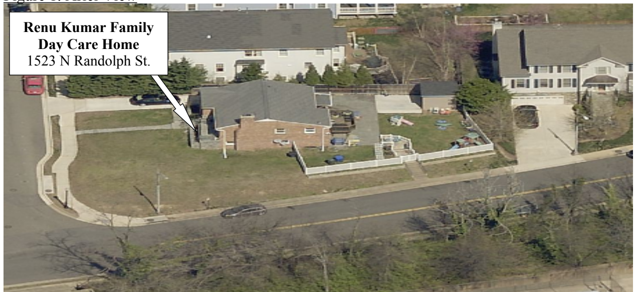
Figure 1. Ariel View

Existing Land Use: The site is a detached single family home on an approximately 9,032 square foot corner lot. A use permit allows for a family day care home for up to nine (9) children.