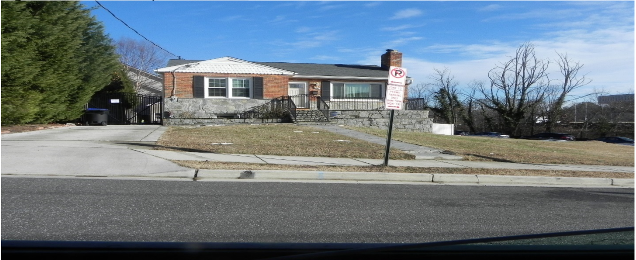
Figure 2. North Randolph Street View