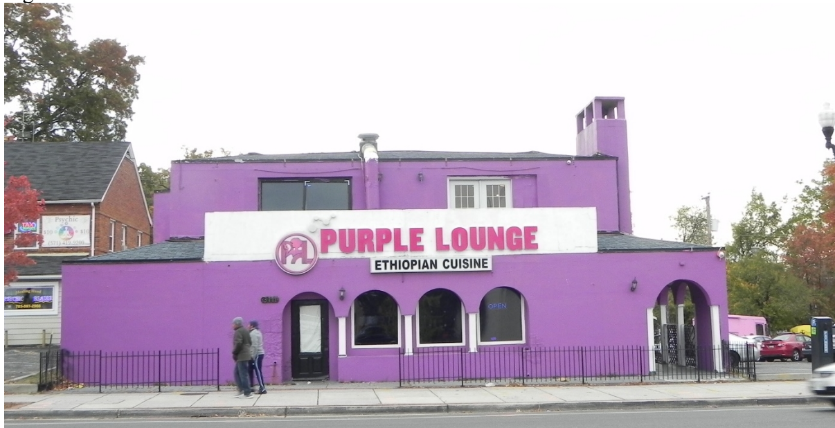
Figure 2: Street View